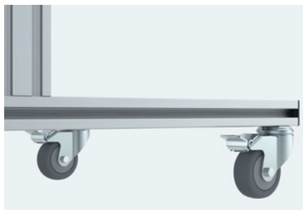
Fixed with swivel castors