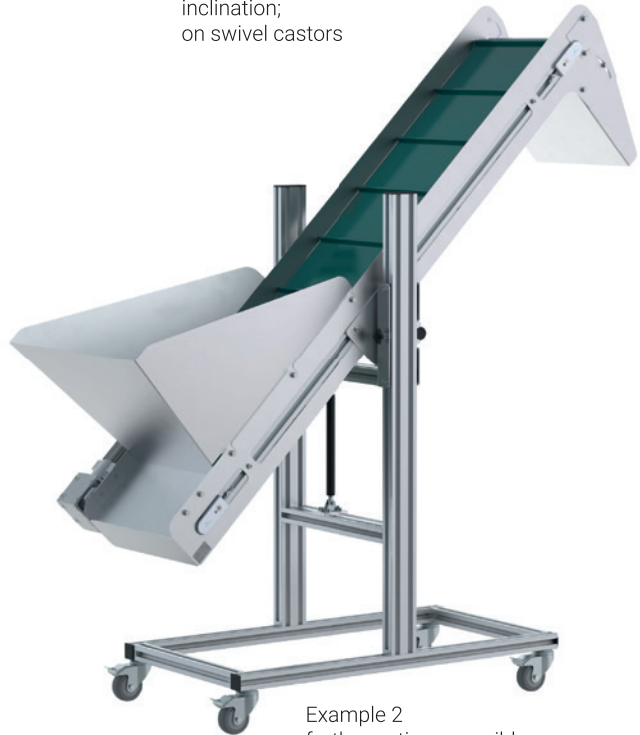
Example 2 further options possible