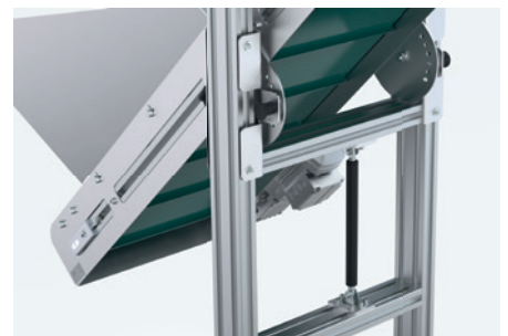
Adjustable in height and inclination