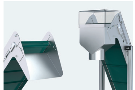
Outfeed chute, outfeed hopper, cover hood