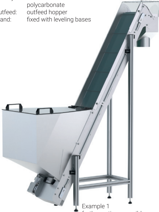
Example 1 further options possible

Feeder Hopper Conveyor with the following equipment: