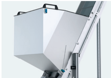
Storage Hopper with fill level indicator sensors