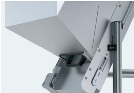
Unloading hatch with sliding lock and visual fill level indicator