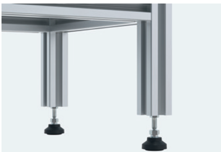
Fixed with leveling bases